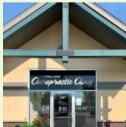
Chiropractic Associate Wanted: Alexandria