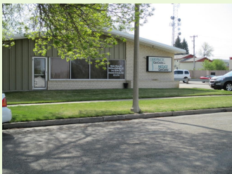
Immediate Opening for a Full-Time Chiropractor