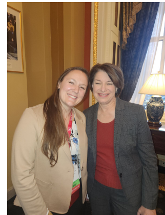
Dr. Jodi Dorpinghaus with U.S. Senator Amy Klobuchar

ACA Engage 2024 provided an opportunity for chiropractic doctors and students to gather for networking, education and business on a national level, as well as participate in lobbying on Capitol Hill. Minnesota representatives met with members of Congress to discuss the Chiropractic Medicare Coverage Modernization Act, a bipartisan bill in both the U.S. House of Representatives and the U.S. Senate that would increase access to chiropractic care for Medicare recipients. On January 30, U.S. Senator Amy Klobuchar of Minnesota signed on as the 10th Senate cosponsor of the bill.