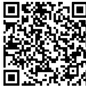
Easy MCPAC direct pay QR Code